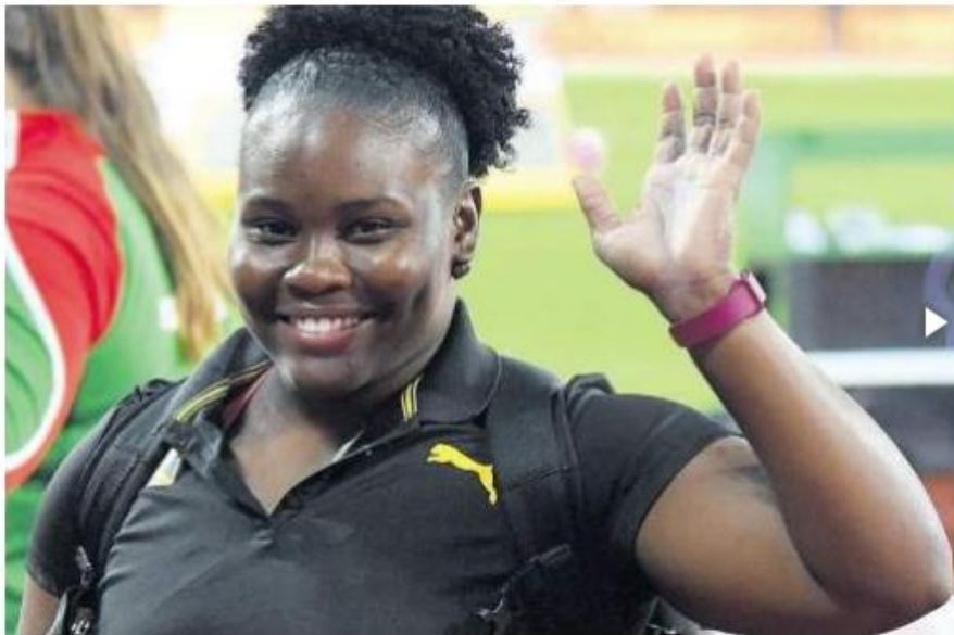
Jamaica's shot-putter Danniell Thomas-Dodd waves after yesterday's women's shot put final at the 2017 World Championships in London.

LONDON, England — Danniell Thomas-Dodd came within arm's length of a historic World Championship shot put medal, finishing fourth with a throw of 18.91 metres after holding the bronze position up to the final attempt.