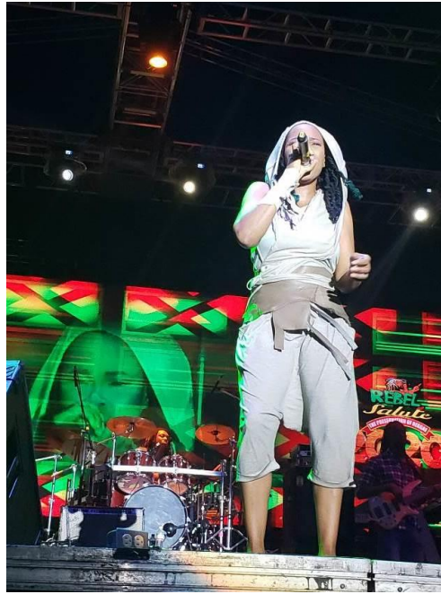
Above: Beenie Man and Queen Ifrica were among the acts delivering stellar performances at Rebel Salute 2020 held at Grizzlys Plantation Cove in Ocho Rios on January 18