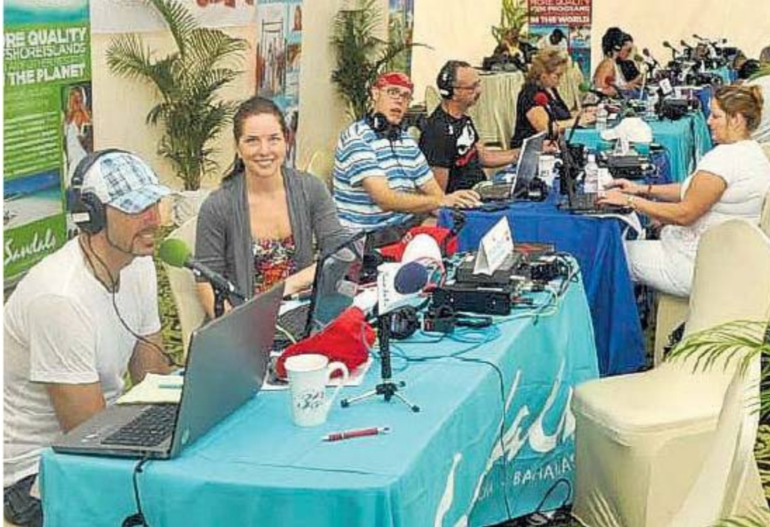
Some of the 27 radio stations from across Canada participating in the fifth annual Sandals Canadian Winter Sizzle Radio Remote from January 9 to 27 at Sandals Grande Riviera.