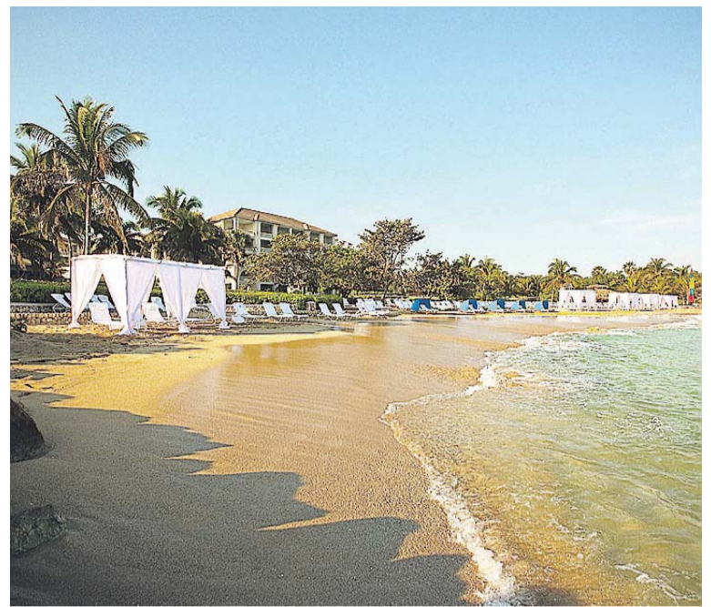
Beach with Cabanas at The Ritz-Carlton.

L OCATED IN Jamaica's exclusive Rose Hall, The Ritz-Carlton Golf & Spa Resort, Rose Hall, offers the seclusion of a beachfront hideaway, complete with the White Witch, an 18-hole championship golf course, a full-service spa, a variety of recreational activities and five acclaimed dining outlets.