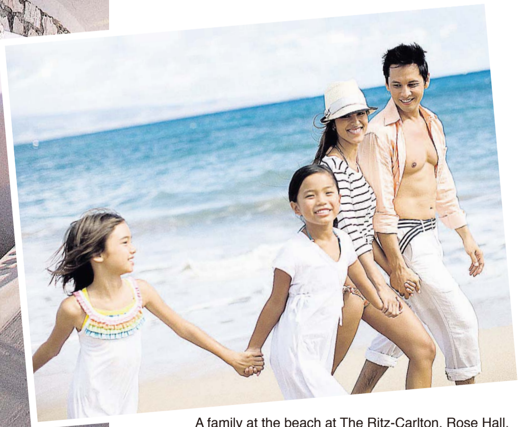
A family at the beach at The Ritz-Carlton, Rose Hall. At left: Cobblestone – outdoor dining at The Ritz-Carlton.

Package is subject to availability and cannot be combined with any other offer. Advance reservations are required. Rates do not apply to groups. Rates listed are per room, per night, single- or double-occupancy, and exclusive of taxes, gratuities and other charges unless otherwise noted. Spa treatment is not inclusive of taxes and gratuities and does not include a full-body massage.